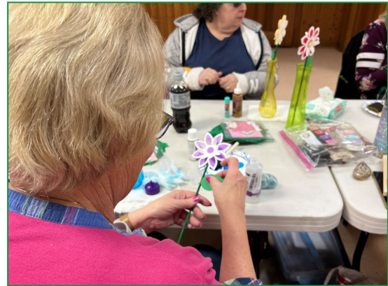
Our seniors group holds monthly meetings with crafts and speakers, lunch outings and bus trips.

If you scroll our home page, you'll see both news items and an events calendar showing all upcoming public meetings, and events. Under Community at the top of our home page you'll see a "Senior" link that focuses on our seniors group,