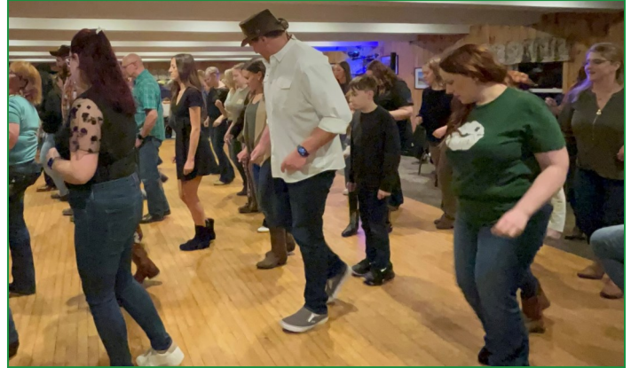
Hundreds attended our first community Hoedown in March. Another line-dancing event will take place May 10.